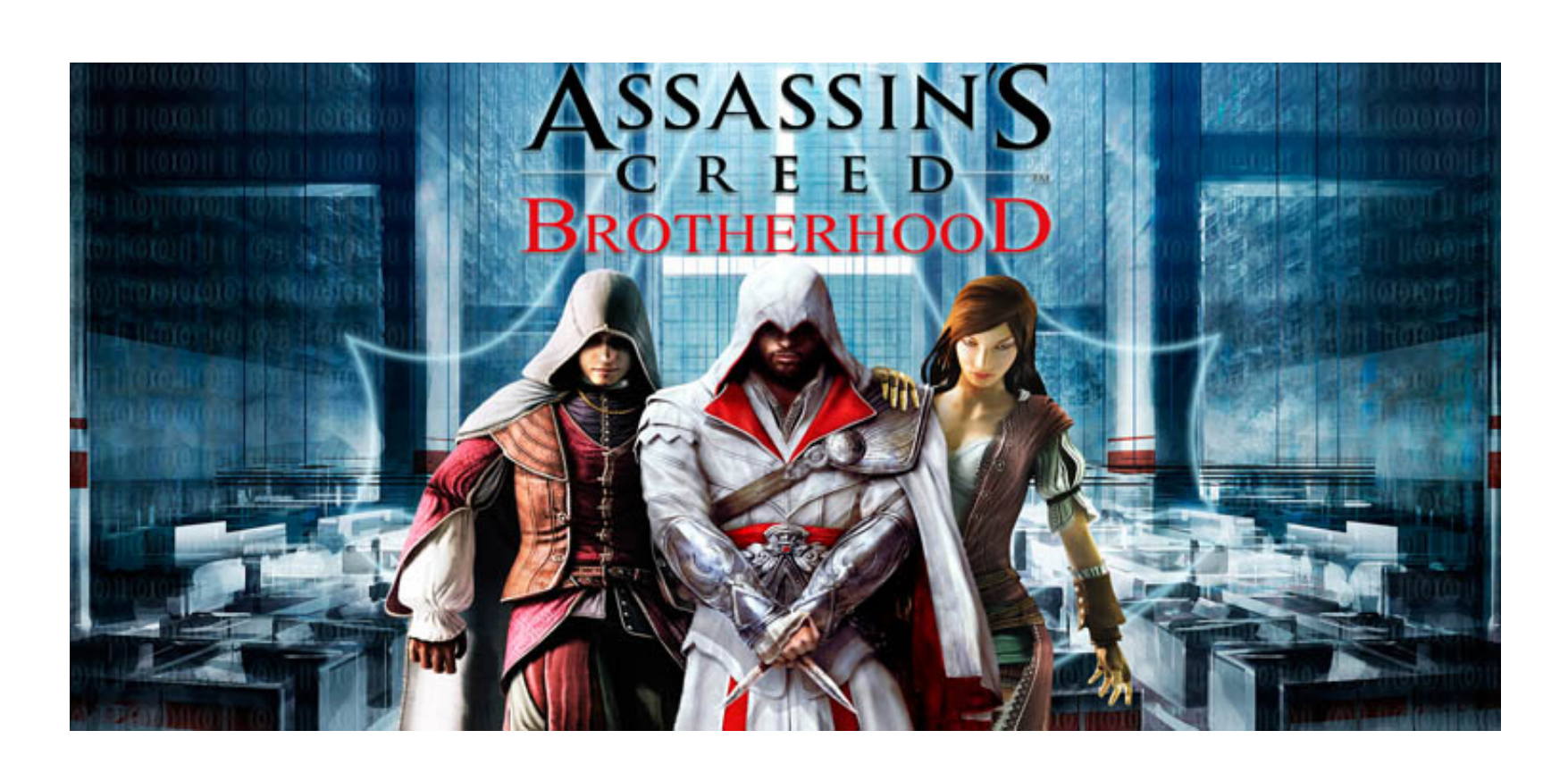
Sounds Eng.pck Assassins Creed Brotherhood.rar